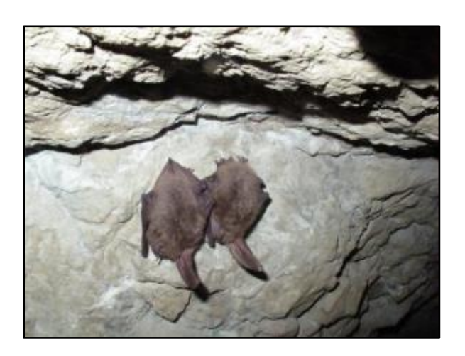
Two Townsend's big-eared bats found hibernating in a mine in West Kootenays, B.C.