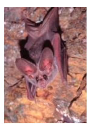
Southwestern Desert Bats Class October 10-12, 2014 Desert Studies Center at Soda Springs (Zzyzx) south of Baker, CA

The Wildlife Society 21st Annual Conference, Pittsburgh, Pennsylvania, October 25-30, 2014 http://www.wildlife.org/conferences