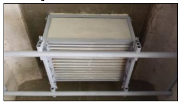
Figure 2. MODERNBAT modular boxes by RD Wildlife Management © April 2014

The Regional Transportation Authority Wildlife Linkages Working Group in Tucson approved just over $80,000 to fund incorporation of bat habitat into an existing bridge at Cortaro Road, just one mile north of the Ina Road Bridge and into one of the two new bridges replacing the existing Ina Road Bridge.