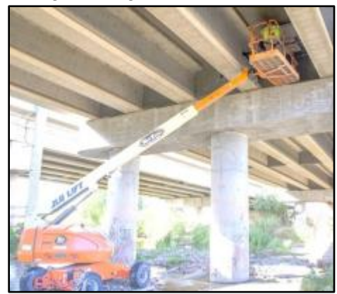
Figure 3. Installation of MODERNBAT © box under Cortaro Rd. Bridge

Road Bridge and in the new bat box under the Cortaro Bridge, to provide baseline data for comparison to post-construction conditions. Comparison with baseline conditions will allow us to determine the effectiveness of the new design in recreating existing bat roost conditions.