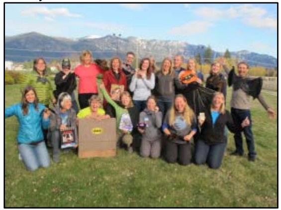
Educators participating in "Bat Workshop for Educators" hosted by the Kootenay Community Bat Project.

Voices for Kids, dozens of school programs each year.