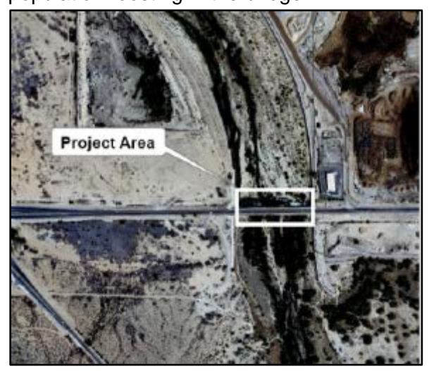
Figure 1. Ina Road Bridge over the Santa Cruz River, Marana AZ

10,000 to 15,000 thousand bats; cave myotis and Brazilian free-tailed bats during the summer, with less than 1,000 Brazilian free-tailed bats present in the winter. While the existing Ina road bridge provides an abundance of high quality crevice habitat, it has become structurally unsound and is inadequate to handle traffic volumes. As part of the environmental scoping process, Arizona Game and Fish (AZGFD) recommended mitigation for the large bat population roosting in the bridge.