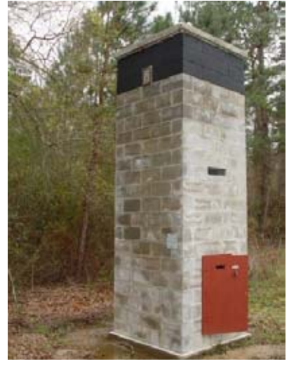
Trinity River NWR bat roost.

big-eared bats sometime between January and March 2005. By June 2005, 10-15 bats had moved into the roosts and that number increased to 20 by July. The bats have stayed throughout the summer.