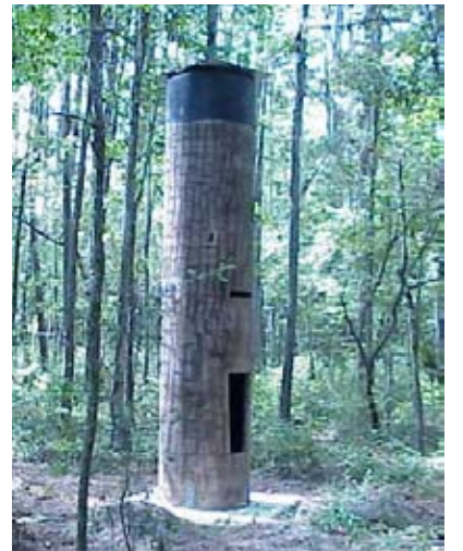
Angelina NF pipe roost tree.

Several partners this past year have taken the initiative to provide supplemental habitat in the way of artificial hollow trees. These artificial trees were created by BCI in cooperation with a private landowner in Georgia in 2000. Since that time they have been tried in North Carolina, Florida and Mississippi. In 2004 and 2005, the Trinity River National Wildlife Refuge, Angelina National Forest and the Shangri-La Botanical Gardens all installed these artificial trees with much success. The Trinity River NWR roosts were made out of cinderblock and were installed in September 2004. Success came quick as these roosts were occupied by at least a couple of Rafinesque's