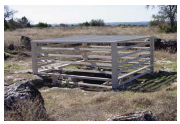
Shell Bat Cave, Fort Hood.

armor and infantry units to develop and maintain war-fighting tactics. In order to protect the bat cave from this activity, a highly visible diverter trail which deflects traffic from the cave area was established as well as a rock barrier around the cave itself. Research and monitoring is continuing on this cave. Two additional caves have been discovered that were once home to thousands of cave myotis bats. Vegetation had enclosed upon the roosts making it unusable by the bats. Vegetation has been cleared and the caves are being monitored for any new bat use.