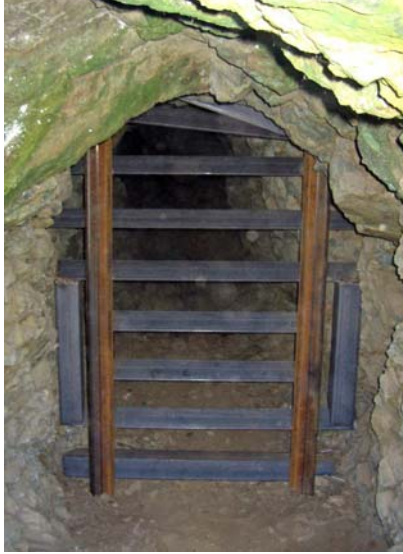
Joel Tigner (middle photo) of BatWorks watches welder Rod Hubbard (left and middle) during their construction of bat gates on the Flathead Indian Reservation in Western Montana. The right photo shows one of the finished gates.