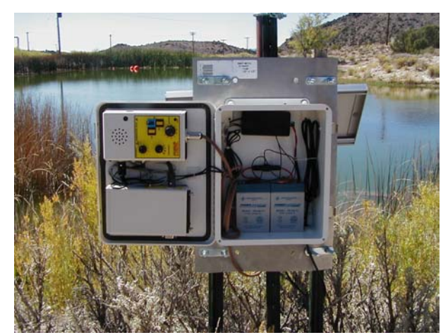
Figure 1. Long-term acoustic monitoring station at Camp 17 Pond, Nye County Nevada.

Also, two bat gates were installed in a tunnel that was being closed. These were the first bat gates to be installed at the Nevada Test Site. Future monitoring will evaluate if bats continue to use this site after gate installation.