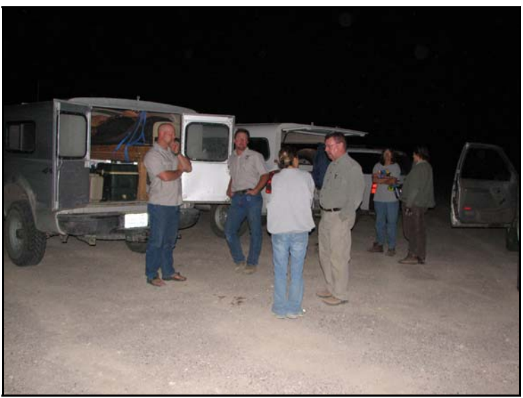
Figure 1. Part of the Nevada Bat Working Group, 2007 Bat Blitz crew.

This past summer the Nevada Bat Working Group held the first annual Bat Blitz for the state. The 2007 blitz focused on clusters of abandoned mines in Esmeralda county. A total of 78 mines were evaluated as potential bat habitat. Over 20 people participated over 3 nights (Figure 1). This terrific turnout allowed many of the mines to have more than one outflight survey conducted. Of the 78 mines, 63 (81%) were recommended to be excluded and permanently closed for human safety reasons. These mines were permanently closed at the end of September. The Blitz is a demonstration of the power of cooperation and coordination between Federal, State, and private partnerships. We intend to conduct the Blitz each year and while the focus may not always be abandoned mine closure, it will always focus on working together with all interested parties.