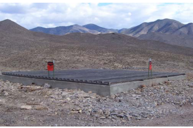
Figure 4. Completed bat gate near Gabbs, Nevada