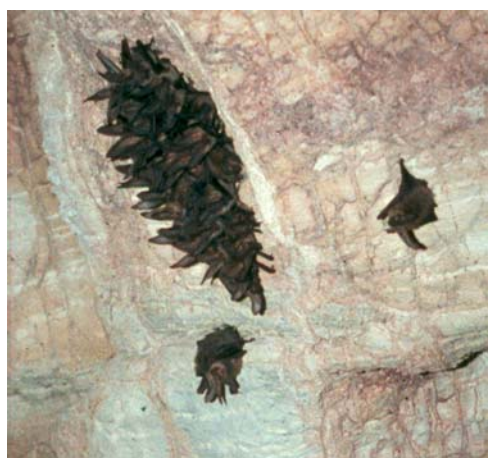
The maternity colony at a cave in Nevada.