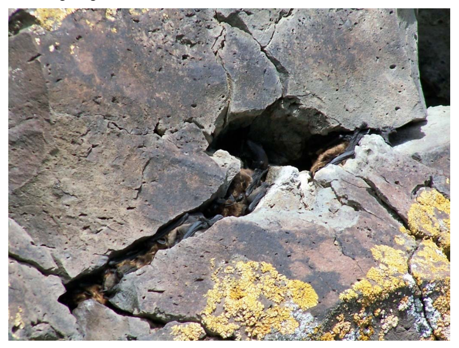
Little Brown bats basking in the sun in crevices over the Yukon River, near Whitehorse. Crevices with different aspects are used throughout the day to maintain optimal exposure.

2007 was the 11<sup>th</sup> season of research at several Myotis lucifugus maternity colonies in buildings and rock crevices in the southern Yukon Territory. Recaptures from a sample of over 900 bats banded at several sites has documented roost and foraging area philopatry, population dynamics, longevity, longer-distance roost switching and cohesive movements of colonies. A crevice roosting colony routinely basks in the sun. Topics addressed in other research efforts are the distribution of M. lucifugus subspecies, seasonal food habits, daily and seasonal activity patterns and the presence of other bat species. Collaborators for a comparison of population genetics of M. lucifugus in the Yukon and Southeast Alaska, where Yukon bats may hibernate, are being sought.