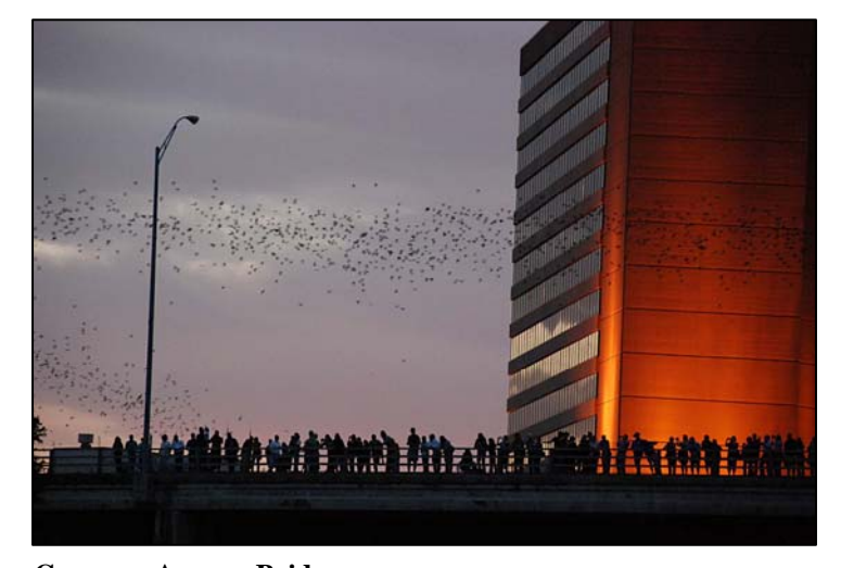
Congress Avenue Bridge.