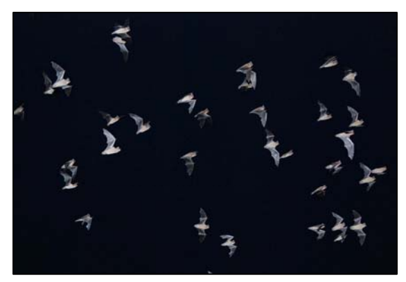
Mexican free-tailed bats.