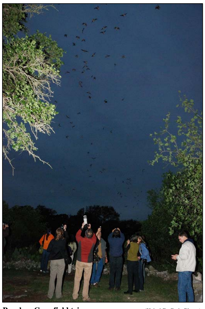
Bracken Cave field trip.