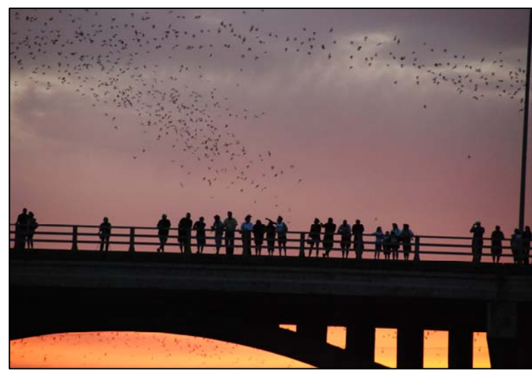
Mexican free-tailed bat emergence.

Social - Poolside & Congress Ave Bridge Emergence