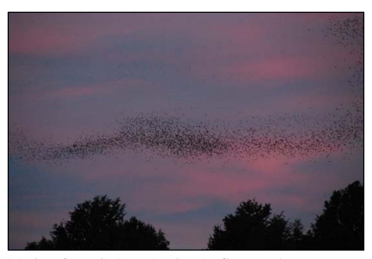
Mexican free-tailed bats leaving the Congress Avenue Bridge.