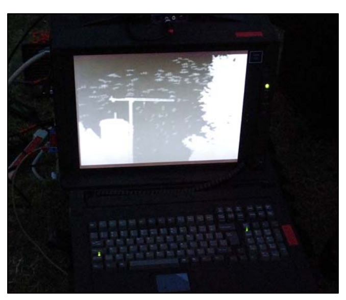
Infrared Thermal Imaging.