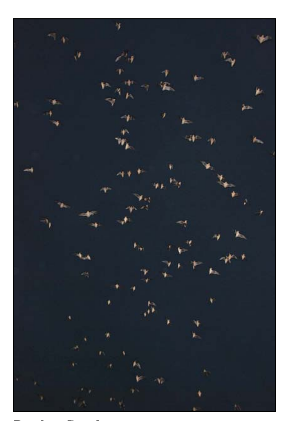
Bracken Cave bat emergence.