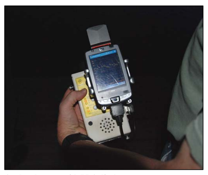
Anabat detector with PDA display.