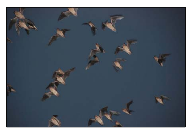
Mexican free-tailed bats.